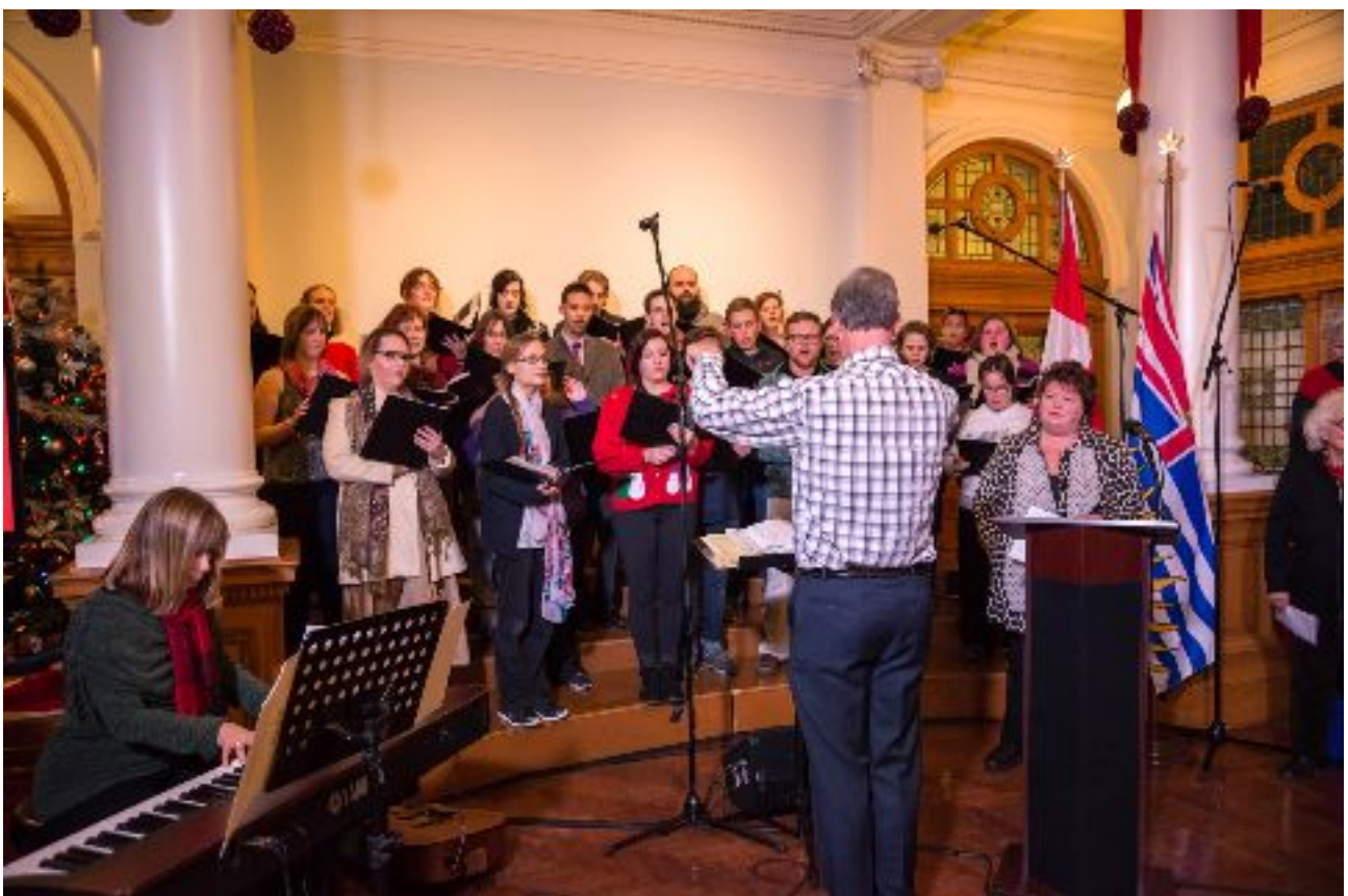
SingYourJoy performs at Christmas Lights Across Canada in the BC Legislature Rotunda, December 8, 2016